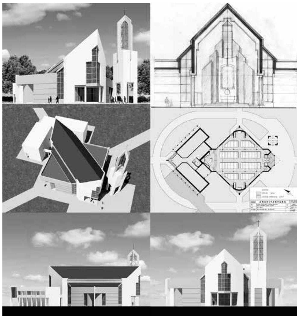
III. 5. Church with its Parish Centre at “Staromieście-Ogrody Estate” in Rzeszów – conceptual design 2015, Author: arch. Mieczysław Gała, cooperation: arch. Elżbieta Wlezień.