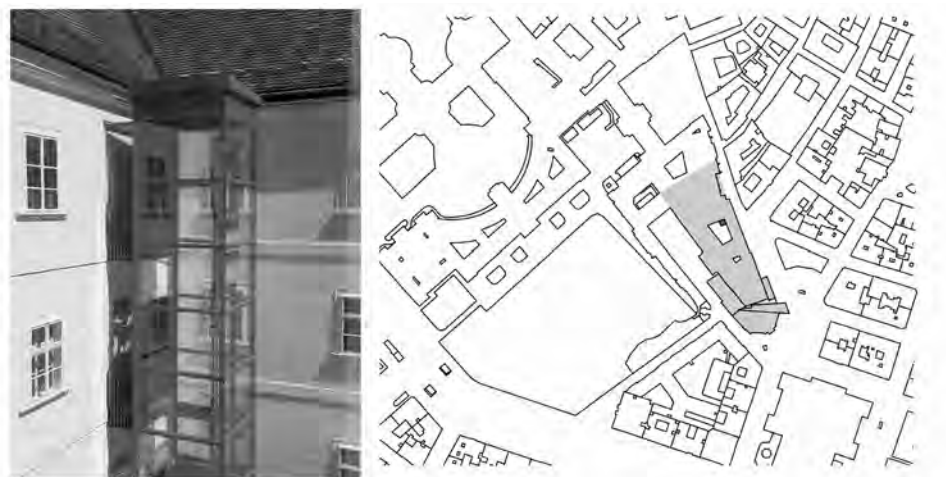
III. 2. View of the elevator (by Monika Adamska) and a localisation scheme of the Albertina Museum in Vienna (authors' elaboration).