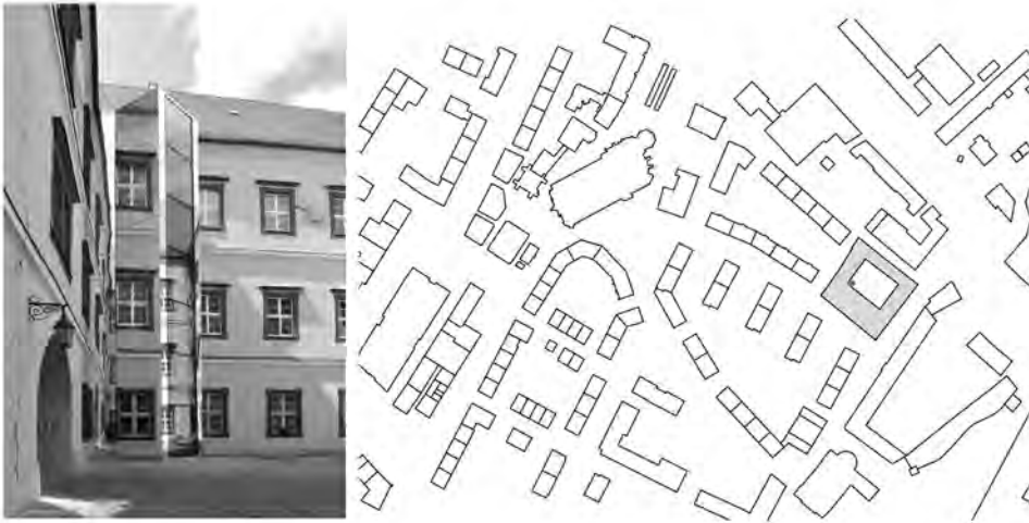
III. 1. View of the elevator (by Dawid Plachta) and a localisation scheme of the Museum in Nysa (authors' elaboration).

All the design approaches used in the analysed examples, whether additive or partially interfering with the structure of the monument, seek to improve the accessibility of the facility, enriching the historical fabric with another layer. It not only enhances the functionality and accessibility of the facility but also affects its aesthetic perception. Therefore, its implementation in a historical context should always be vigilant in responding to this context, proposing individualised solutions even with the typical “technical” fulfilment of the function itself.