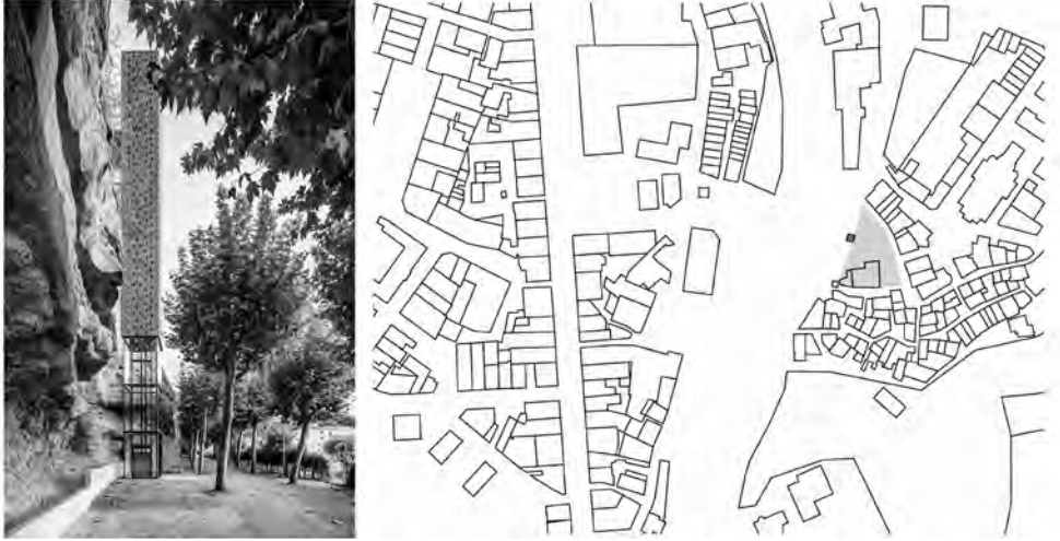
Ill. 5. and a localisation scheme of the Gironelli Centre (authors' elaboration).