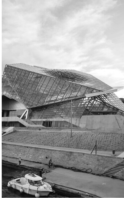
Ill. 4. Villa S, Coop Himmelb(l)au