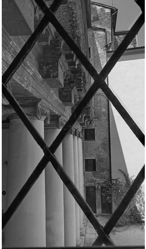
Ill. 2. Villa Rotonda, Andrea Palladio